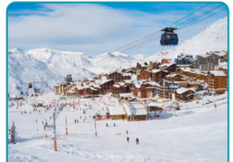
Popular activities in the Alps include skiing, hiking and sightseeing