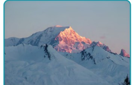
Mont Blanc is the highest mountain in the Alps.